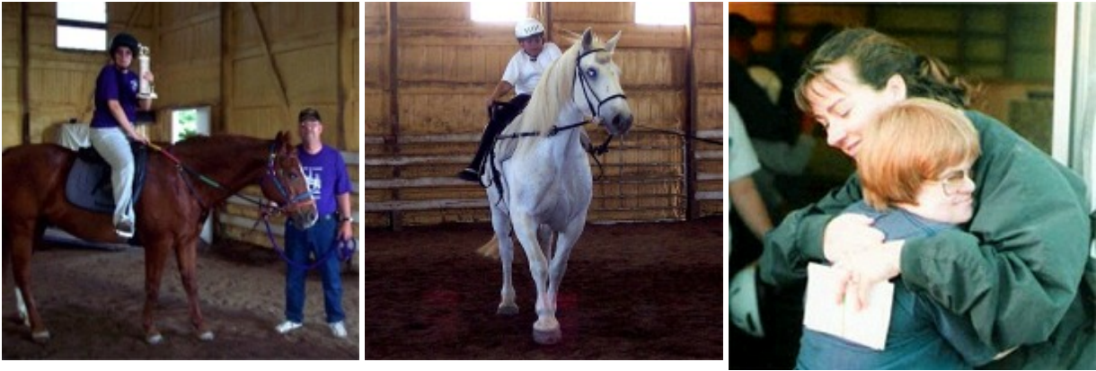
Just a few of our Riders and Friends